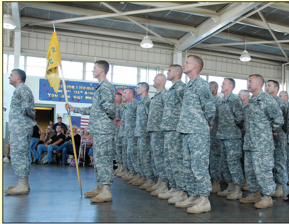
One happy young man joins Soldiers of the 2nd Battalion, 123rd Armor in formation during a welcome home ceremony held in Bowling Green, Ky. on Sept. 28. Known as "The Orphan Battalion," the Soldiers conducted combat patrols, responded to escalation of force incidents and participated in base defense exercises. They were also instrumental in building a playground for Iraqi children.