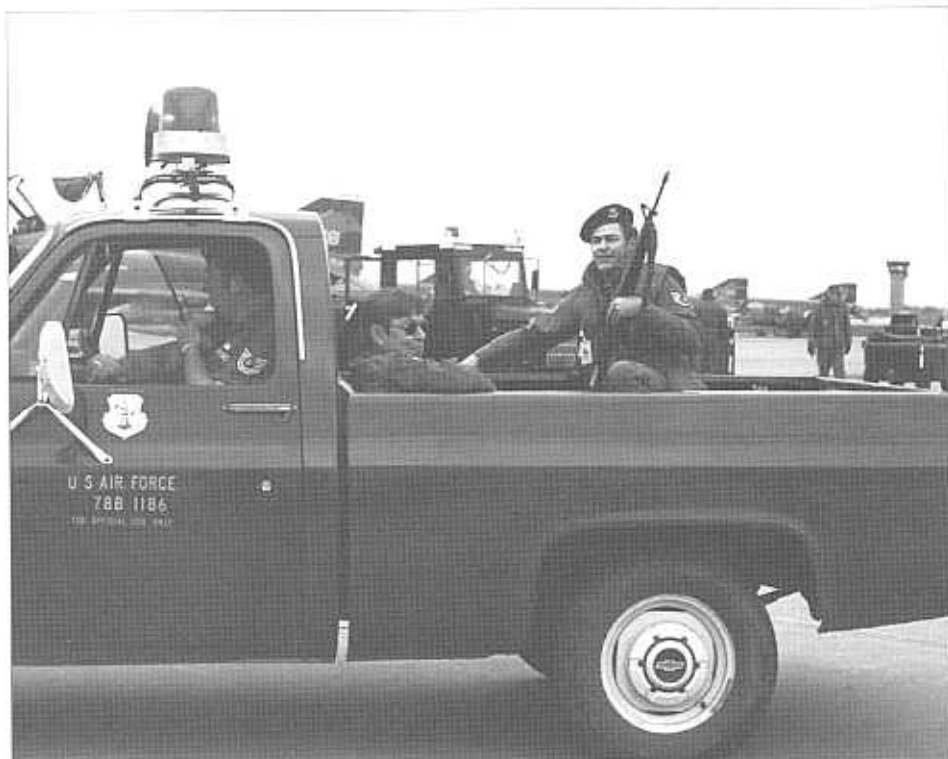
KyANG historical archive

Twelve firefighters served at Scott Air Force Base, Ill., and 12 more were sent to Tyndall Air Force Base, Fla.