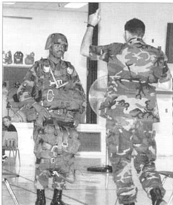
123rd Special Tactics Flight