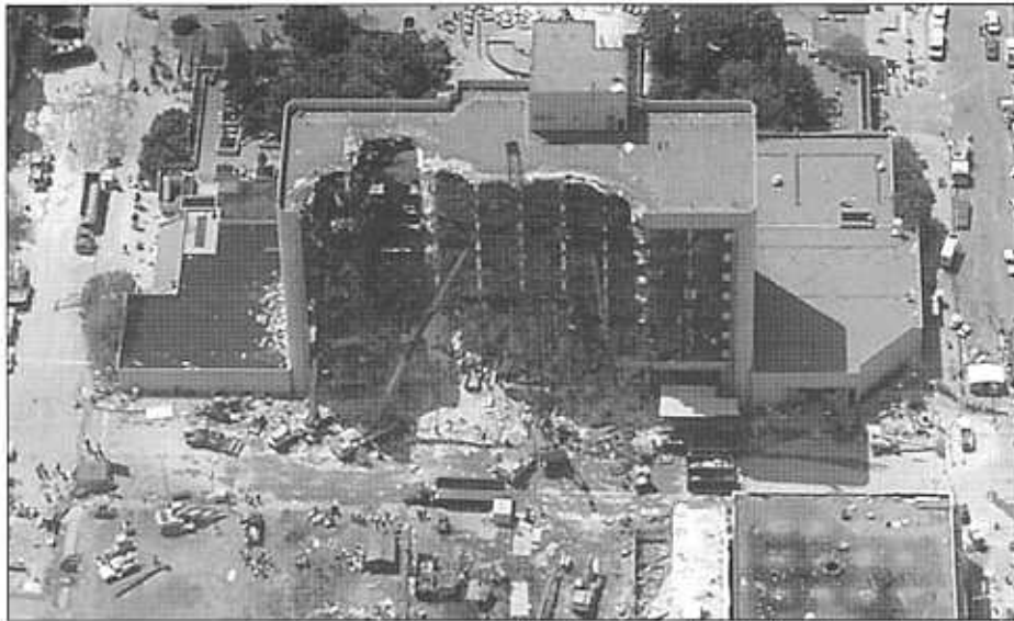
OK ANG

The devastated Murrah Federal Building in Oklahoma City is a haunting image to many of the National Guard volunteers who served there.