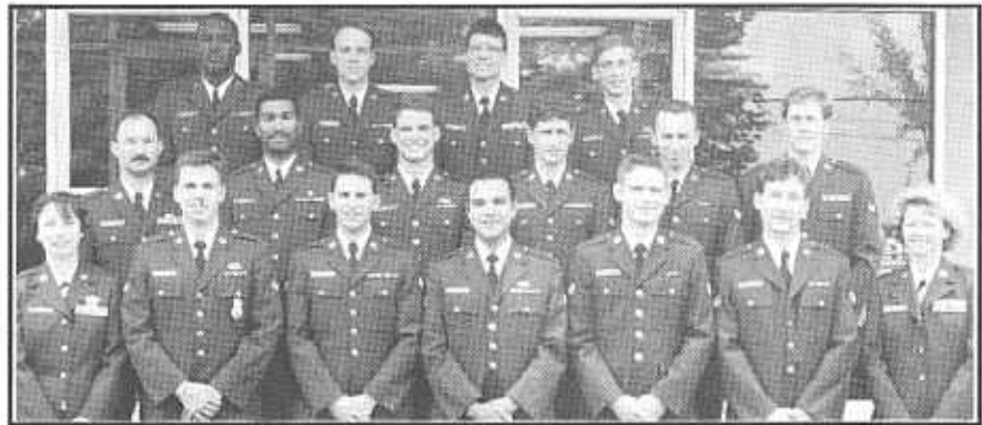
KyANG

"A Celebration For Youth" is underwritten by the Bank of Louisville, Liberty National Bank, Citizens Fidelity Bank & Trust Co., and First National Bank.