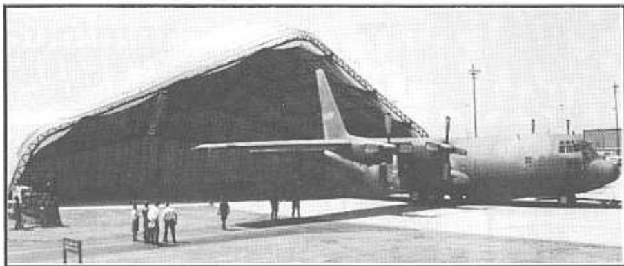
KyANG Photo by TSgt. Charles Simpson