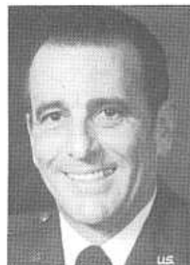
Col. Joseph L. Kottak Wing Commander

Perhaps the words in the most famous speech of Abraham Lincoln - delivered on the Gettysburg battle ground still describe it best - "that we here highly resolve that these dead shall not have died in vain - that this nation under God - shall have a new birth of freedom - and that government of the people, by the