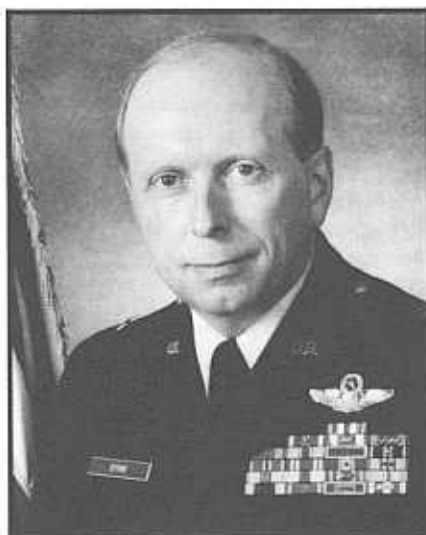
Brig. Gen. Stewart R. Byrne 123rd Airlift Wing Commander

To improve production we are empowering workers at all levels to make decisions about their jobs. The worker closest to the task to be performed must understand the customers' expectations, of-