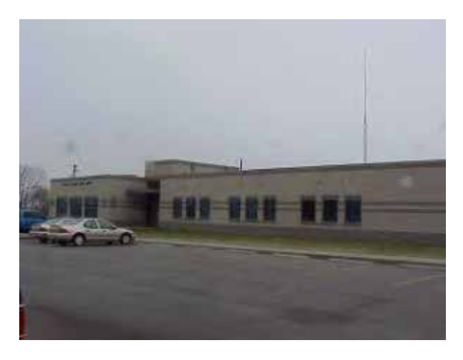
Shelbyville Readiness Center