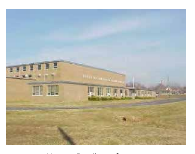
Glasgow Readiness Center