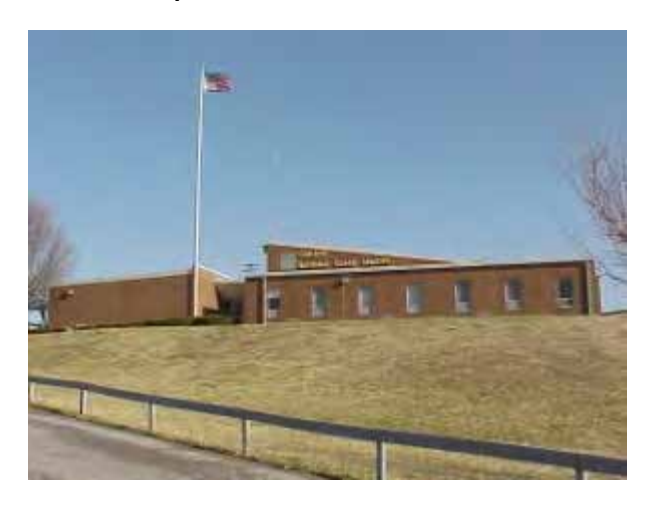
Carlisle Readiness Center