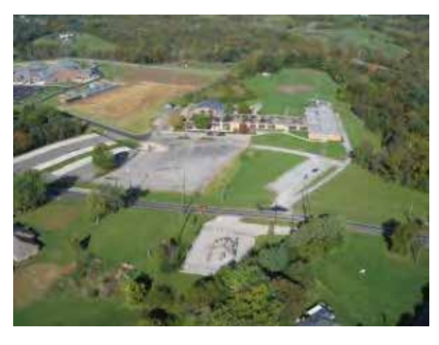
Independence Readiness Center