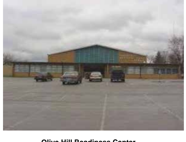
Olive Hill Readiness Center