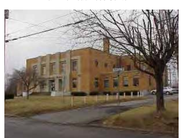
Elizabethtown Readiness Center