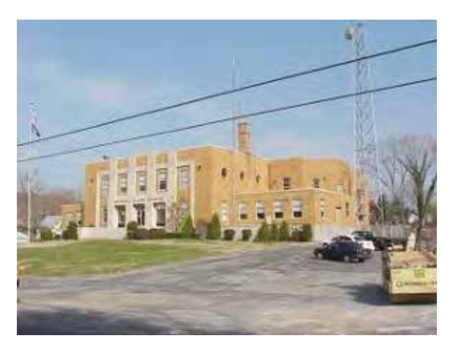
Somerset Readiness Center