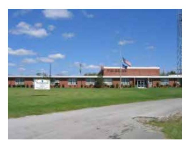
Hopkinsville Readiness Center