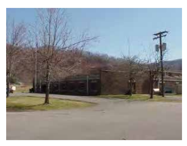
Harlan Readiness Center