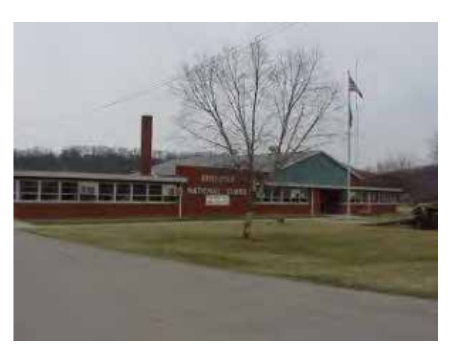
Carrollton Readiness Center