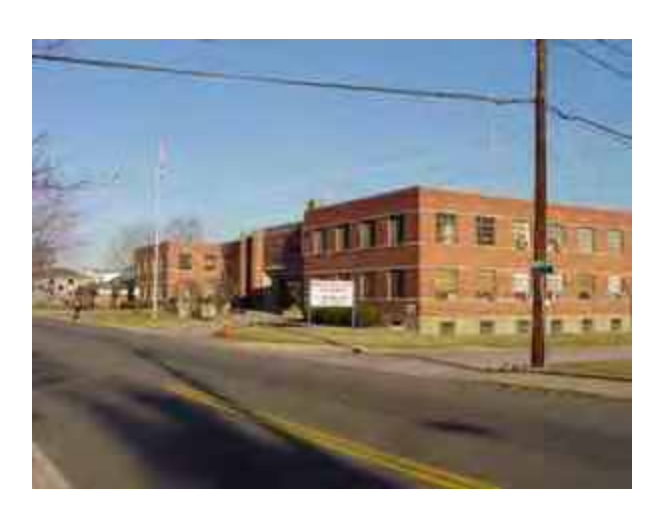
Ashland Readiness Center