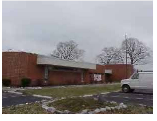
Russellville Readiness Center