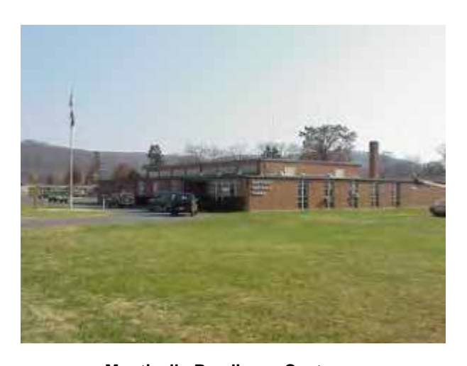
Monticello Readiness Center