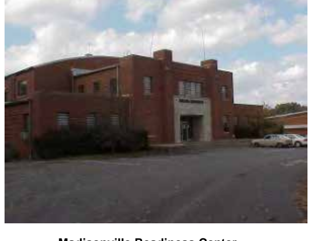
Madisonville Readiness Center