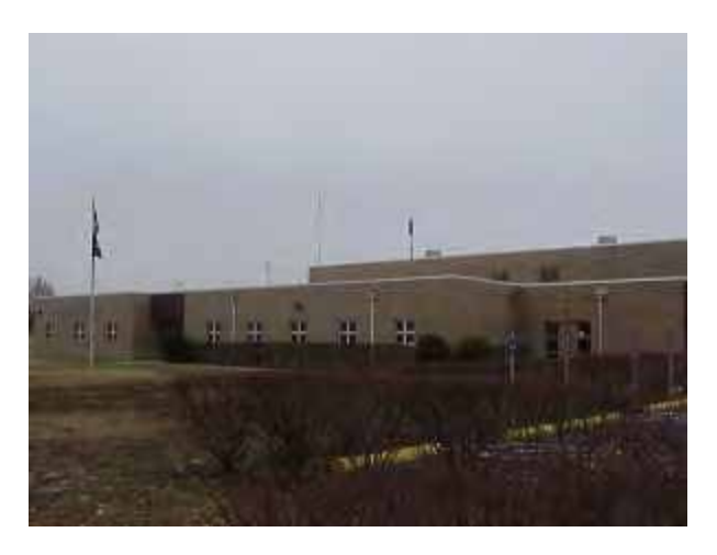
Murray Readiness Center