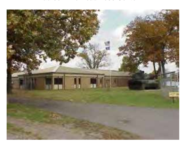
Marion Readiness Center