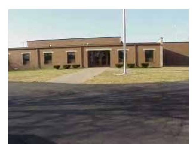
Harrodsburg Readiness Center