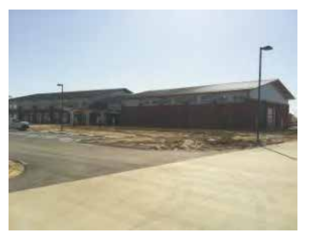
Owensboro Readiness Center