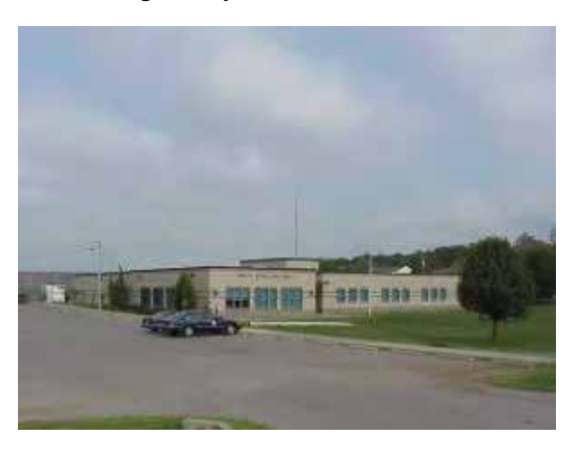
Brandenburg Readiness Center