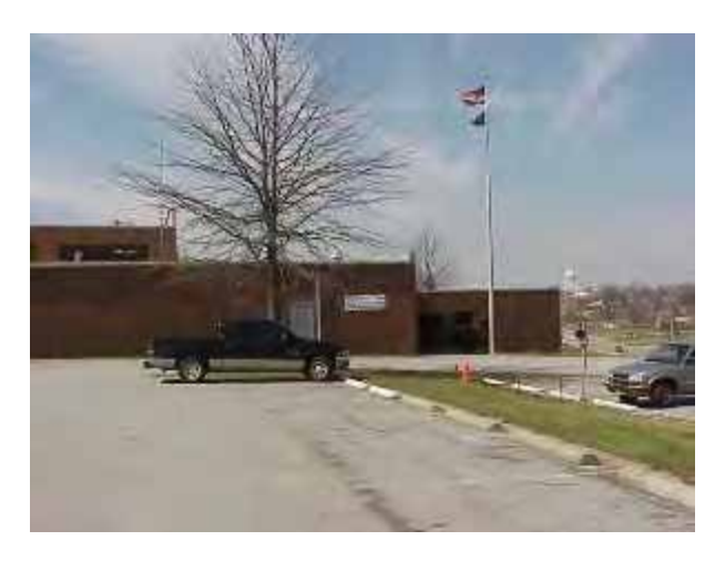
Richmond Readiness Center