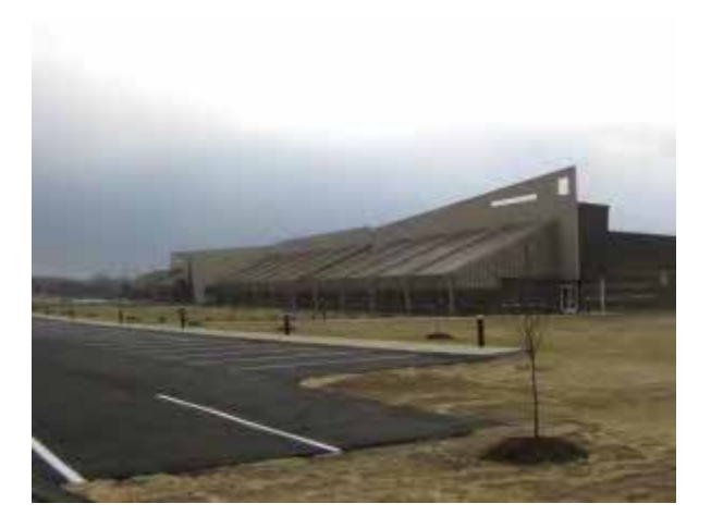
Paducah Armed Forces Reserve Center