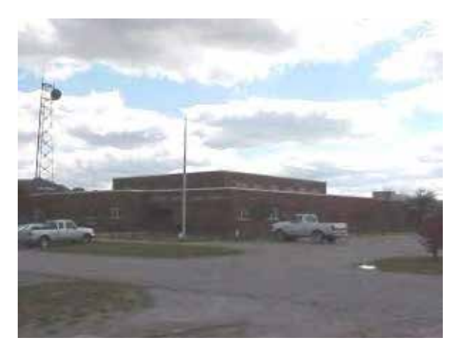
Hazard Readiness Center