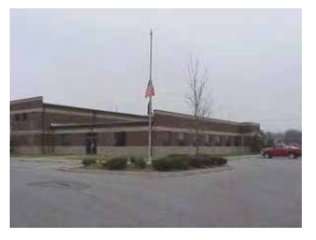
Benton Readiness Center