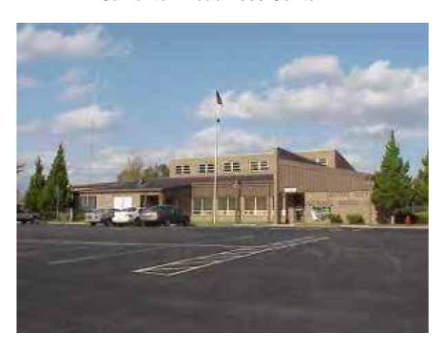
Central City Readiness Center