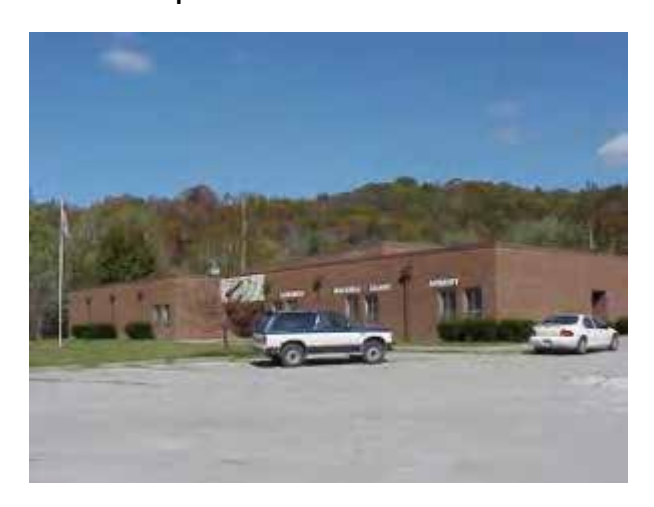
Jackson Readiness Center