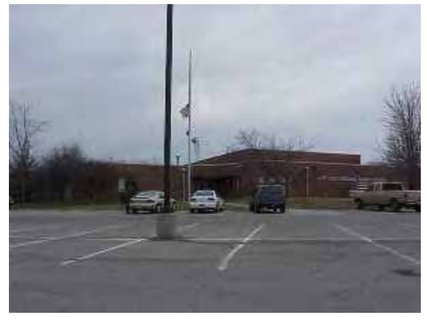
Walton Readiness Center