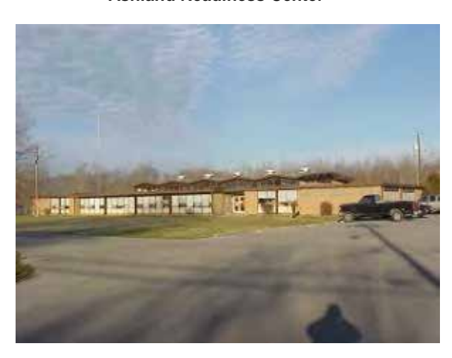
Barbourville Readiness Center