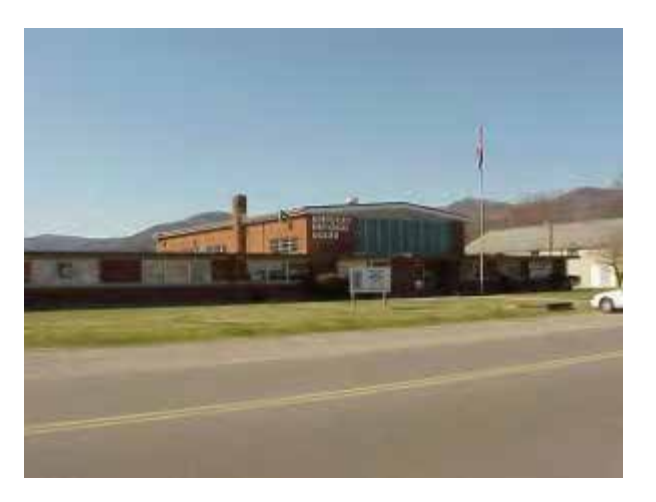
Middlesboro Readiness Center