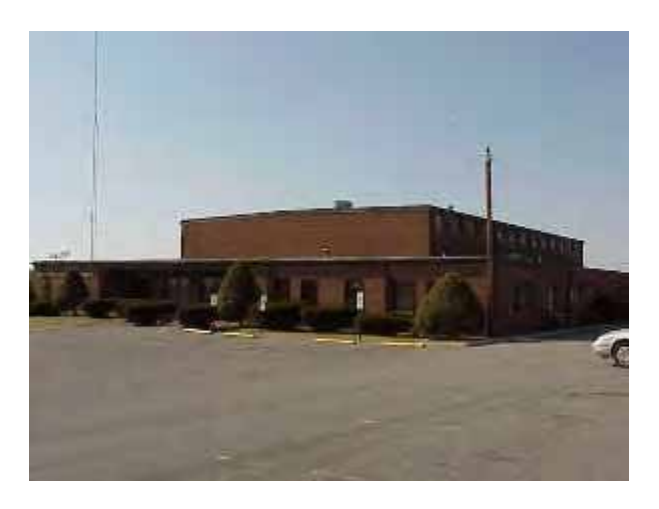
Danville Readiness Center