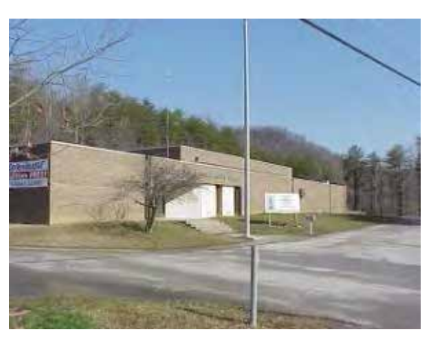
Ravenna Readiness Center