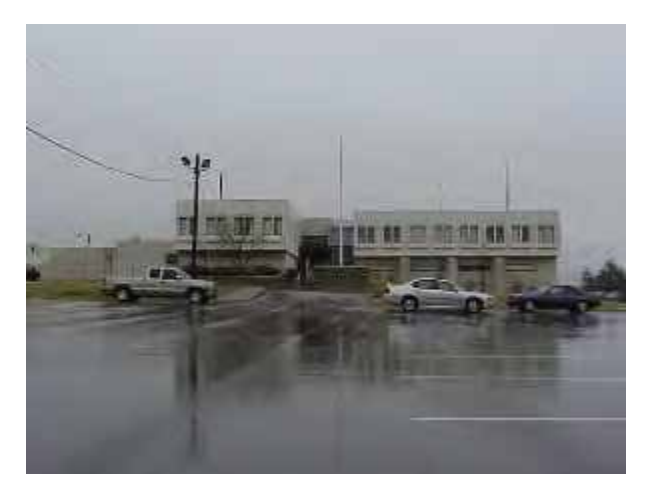
Lexington Readiness Center