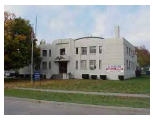
Henderson Readiness Center