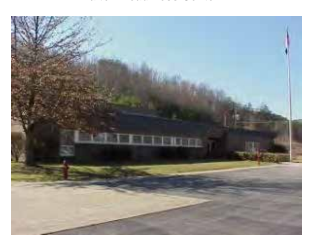
Williamsburg Readiness Center