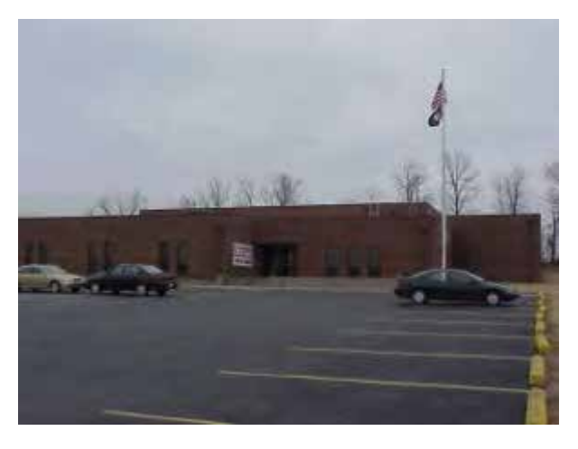
Springfield Readiness Center