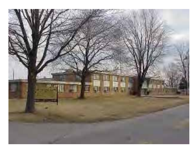
Louisville Fairgrounds Readiness Ctr