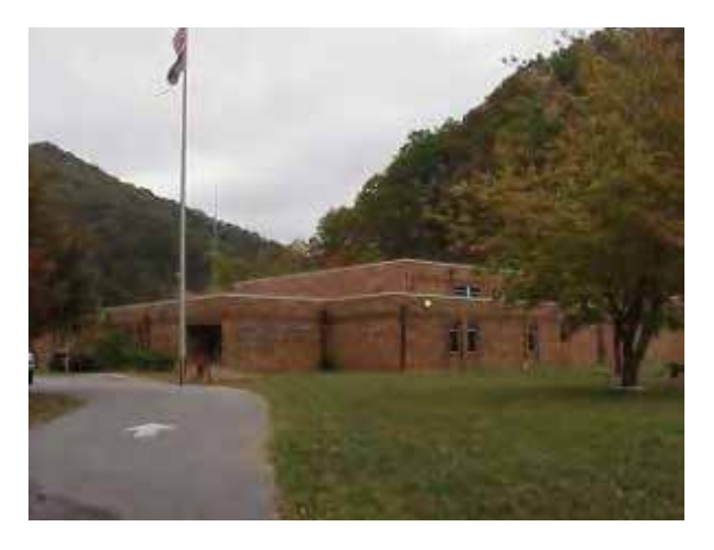
Prestonsburg Readiness Center