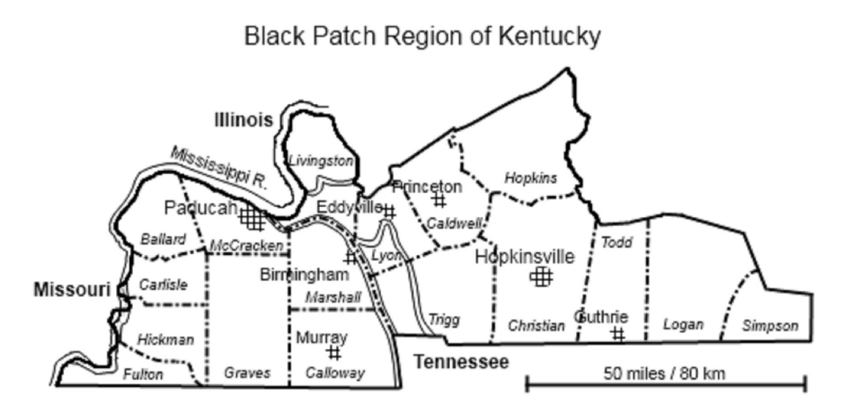
Figure 1: Map of the Black Patch Region (by author)

tobacco products depend on the dark leaf variety for their distinctive flavor. A group that controls the tobacco in this region of western Kentucky and Tennessee controls the worldwide supply of dark leaf tobacco. Dark leaf tobacco was the dominant cash crop and export product of the Black Patch, so the economy of the region depended on the fortunes of the dark leaf tobacco market.<sup>7</sup>