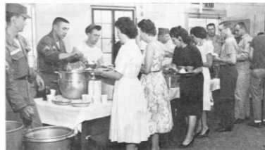
LADIES AUXILIARY VISITS ARMOR CAMP—Wives of members of Headquarters and Hq. Co., 149th Armor Group of St. Matthews are pictured at noon chow time during the group's annual summer training at Fort Knox. The women are members of the only auxiliary in the Kentucky National Guard.

"THIS AIRCRAFT BUILT 22 NOV. 1956 BY DeHAVILAND AIRCRAFT CORPORATION, ONTARIO, CANADA. REBUILT 15 JUN 1961 BY KY ARNG AVIATION MAINTENANCE SHOP, FRANKFORT, KENTUCKY" "HANDLE WITH CARE"