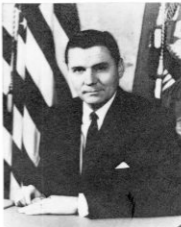
ELVIS J. STAHR