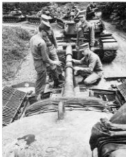
VEHICLE INSPECTION —Members of Company B, First Medium Tank Battalion, Somerset, are shown pulling preventive maintenance on their vehicle during annual summer training conducted in June at Fort Knox. The company is commanded by Capt. Thomas E. Ledridge.