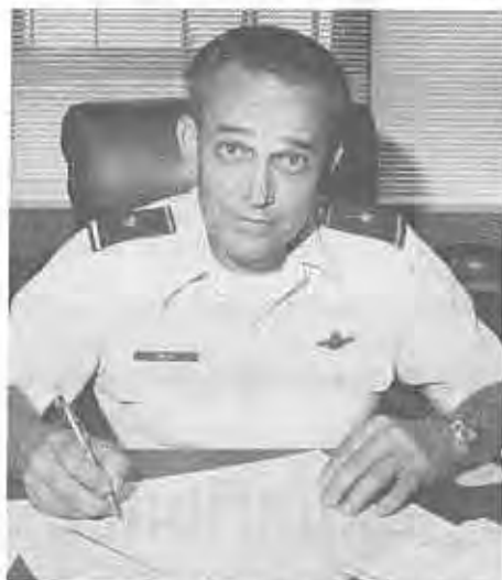
KyANG photo by Terry Lutz