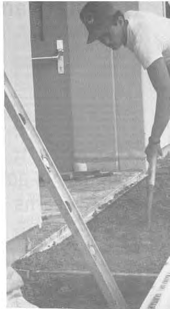
SrA Douglas Brimer prepares building entrance.