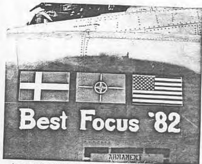
A combination to remember, the Danish, NATO, and the American flags together on the KyANG RF-4C.