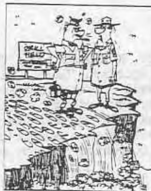
"When all of a sudden my mind went blank, I couldn't remember how to say 'F.O.D.' To the rear march! 'Column right' or anything."

1982 REUNION FINAL CALL : The day will begin with Military Challenge Run II. Proceeds will go to the Kentuckiana Hemophilia Foundation. The main events will start at 1 p.m. with a basic orientation near the O&T building. Base tours and visits to duty stations will commence at 2 p.m. Group photos will be taken between 3 to 4 p.m. The KyANG Club will be supplying refreshments and other forms of entertainment after 3 p.m. The reunion's on-base activities will end at 6 p.m. with friends eating out together.