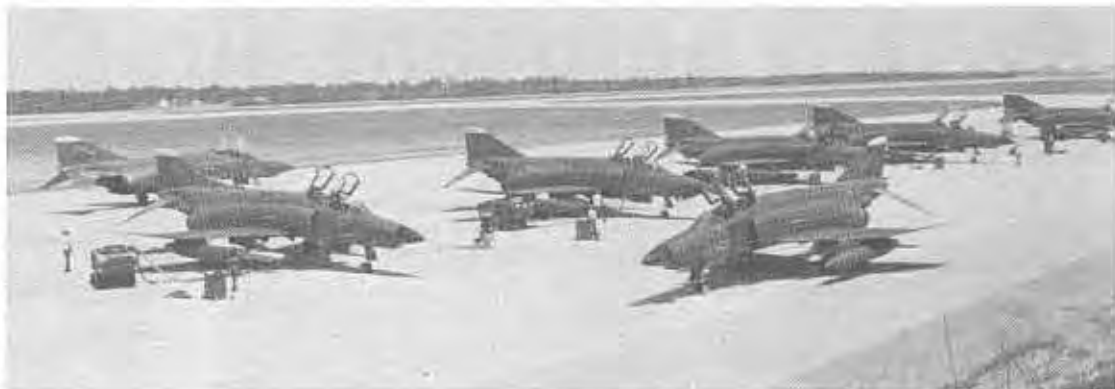
Two RF-4C Phantoms taxi for their first REP sortie.