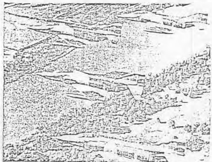
Four Phantom jets of the Kentucky Air National Guard will fly over Burkessville Oct. 9