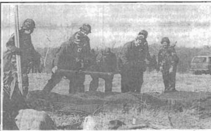
Members of the Mess Section, Company A, 206th Engineers erect GP medium during FTX at Western Kentucky Weekend Training Site.