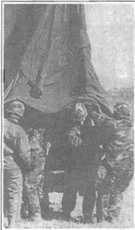
Members of the 206th Mesa Section erect the mess tent during their recent FTX.