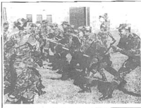
Members of the Service Battery, 1/623rd Field Artillery Springfield, work "both sides of the fence" during civil disturbance training at last month's weekend drill.