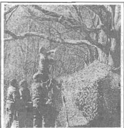
Members of Company A, 206th Engineer Battalion, camouflage a Jeep during the battalion's FTX.