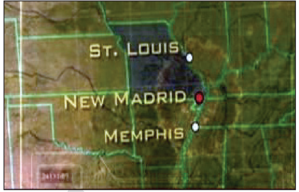
The New Madrid Seismic Line, also known as the New Madrid Fault, stretches 150 miles and extends through five states: Illinois, Missouri, Kentucky, Tennessee and Arkansas. Four of the largest earthquakes in North American history occurred along the fault line between 1811 and 1812.

practicing drills at some point during the month, but it is also a great time for Families to prepare at home as well.