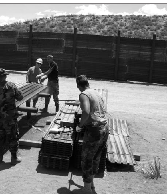
neers weld pieces of steel matting together near