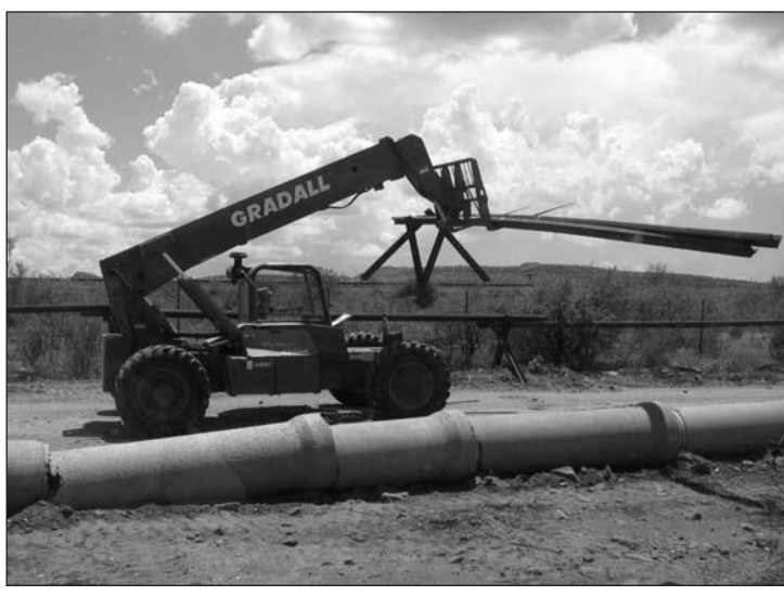
Left: An Airman hauls completed Normandy Barricades to the installation site, where they will be welded to other segments.