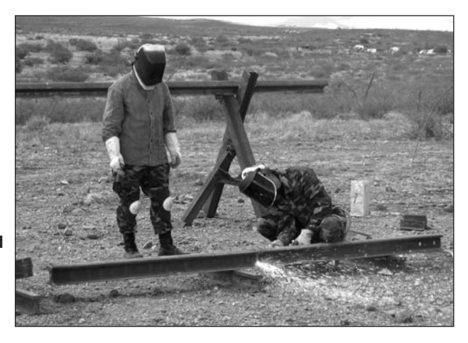
Left: Welders with the 123rd Civil Engineering Squadron prepare railroad rails for use in a type of fencing called Normandy Barricades.