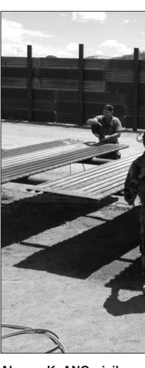
Above: KyANG civil engi Bisbee, Arizona.