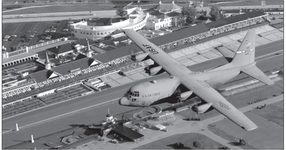
A Kentucky Air Guard C-130H flies down the homestretch at Louisville’s Churchill Downs Racetrack. The 123rd Airlift wing has flown Hercules aircraft since 1989.

Since that historic day, more than 2,200 C-130s in 70 variants of five basic models