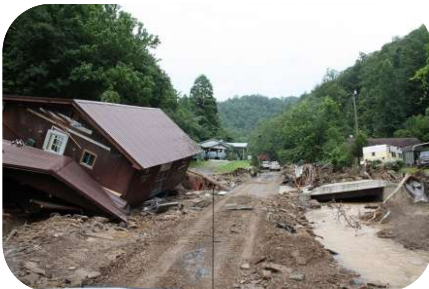
Pike County Flooding

DR-1925 Beginning on July 17, 2010, and continuing through July 30, 2010, severe storms, flooding and mudslides impacted the Commonwealth. The counties of Carter, Elliott, Lewis, Madison, Pike and Shelby were declared eligible for Public Assistance. Public Assistance was granted to 32 governmental and non-profit applicants with projects valued at approximately $11.5 million. Individual and Households Assistance was declared for Carter, Elliott, Lewis, Mason, Pike and Rowan counties. Over 1,600 applicants received more than $10.5 million dollars in Individual Assistance from FEMA and more than $6.2 million in loans from the Small Business Administration.