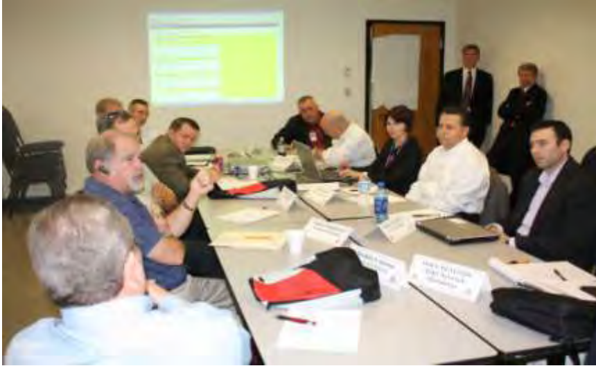
Private Sector Working Group NLE Workshop – Feb 21, 2011

Seizing the momentum generated from lessons learned from the 2009 Ice Storm and other more recent disasters, KYEM is partnering with the private sector to create more resilient and robust communities.