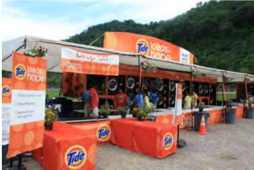
Kentucky VOAD played a key role in bringing Tide's Loads of Hope to assist in the Pike County flooding recovery efforts

Local VOADs were formed in the Barren River Area Development District, Daviess County and Madison County. The KYEM Recovery Branch Volunteer Coordinator assisted the Kentucky VOAD with its first statewide training conference and also consulted with Norton Healthcare System as it offered the Disaster Preparedness for Faith Communities Conference. A two day training event for Long Term Recovery Committees, conducted by national experts from World Church Service, was arranged by the KYEM Recovery Branch Volunteer Coordinator.