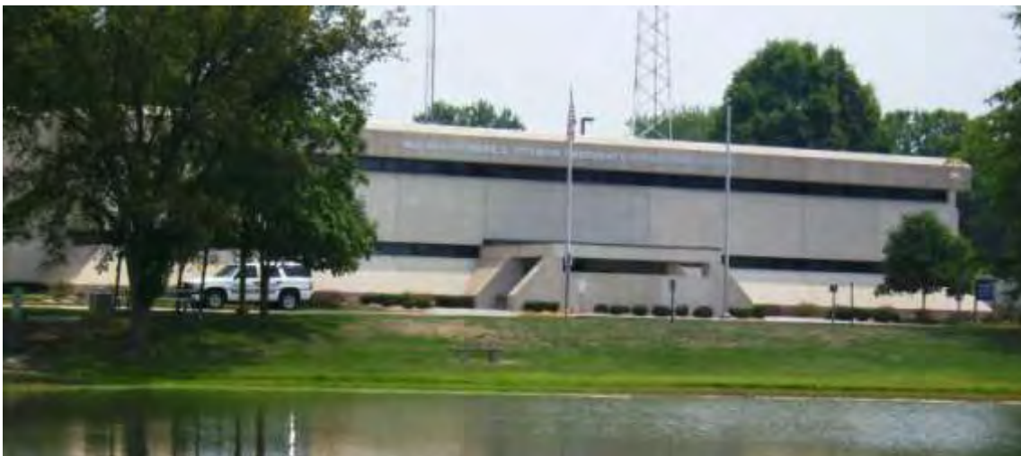
Maj. General Richard L. Frymire Emergency Operation Center, Frankfort, KY

The CEIC logged 4,901 incidents during the reporting period.