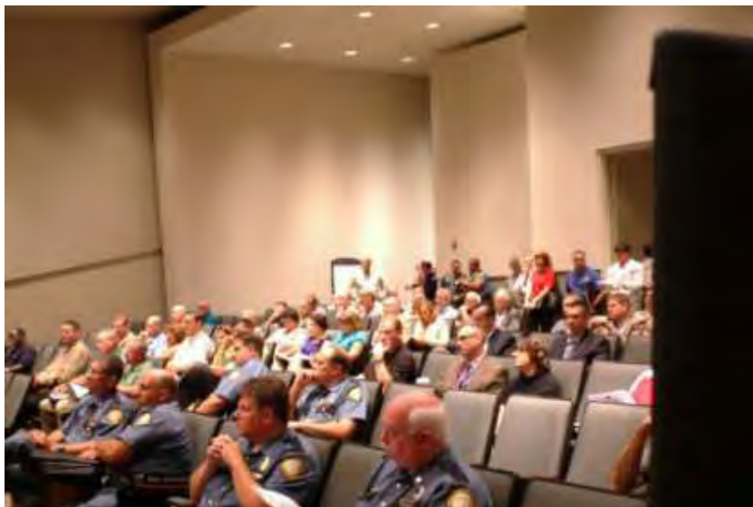
WEG Training Workshop

Another highlight of the year was the globally attended 2010 World Equestrian Games (WEG), which took place in Kentucky from September 25 th through October 10 th . KYEM's involvement in the planning and execution of emergency preparedness in the months leading up to these internationally recognized events were the culmination of more than a year of hard work in conducting training and exercise workshops designed to provide effective WEG training to a variety of local, state and federal partnering agencies.