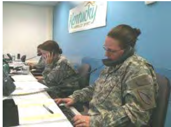
Two Soldiers and one Airman working at the J2 during the National Level Exercise, checking upon the Commonwealth's critical infrastructure

Significant Events from 1 Oct 09 to 30 Sep 10: During this fiscal Year, we have notified and provided assistance to the families of deployed Soldiers wounded in action. The training standard for Soldiers to work with families has increased to add to our professionalism. Currently we have over 50 Soldiers trained to the highest standard to offer assistance to Soldiers and their families. We have also arranged funeral honors and provided assistance for the families of the KYARNG Soldiers and Regular Army Soldiers killed in action. We have also provided assistance processing the Serviceman's Group Life Insurance to Soldiers and families.