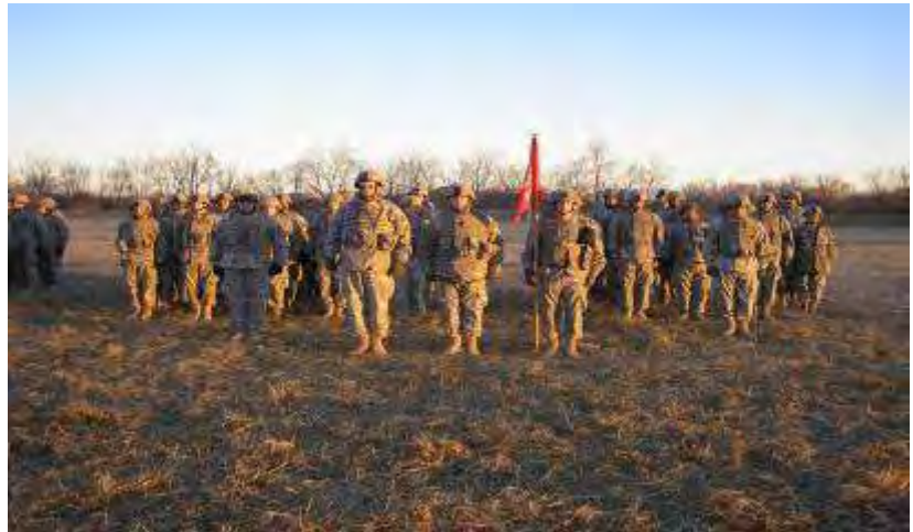
FSC Soldiers in Formation at Camp Atterbury

Over and above supporting these major construction projects, FSC had several administrative accomplishments. FSC received an extremely high CRE score during the 2011 inspection supporting the 201 st EN BN with an overall score of 95%. The unit also sent maintenance experts to her sister companies and enabled the 207 th EN CO to score a laudable 97% in the maintenance inspection of over 100 pieces of equipment. As usual, FSC raised the bar for its sister units to continue setting performance standards in the Kentucky Army National Guard.