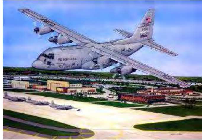
WESTPOINT AIR NATIONAL GUARD COMMUNICATED BY THE AIR FORCE

The 123 AW continued to epitomize the quality of the Total Force by its extraordinary performance in regional contingencies throughout the world. From Southwest Asia to service at home in the Commonwealth, the 123 AW's national reputation as "first to volunteer" remained untarnished.