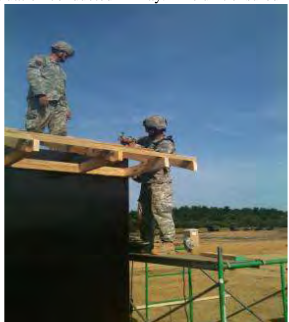
Soldiers from 149 th VERT EN Company working on a SEHUT (South East Asia Huts)

The 149 th executed several home station drills focused on MOS training transitioning soldiers. Several training stations have been constructed to allow carpenters, plumbers, and electricians to hone their skills.