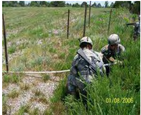
Members of the 577 th Sapper Company, preparing to breach a wire obstacle with a Bangalore Torpedo while providing security.