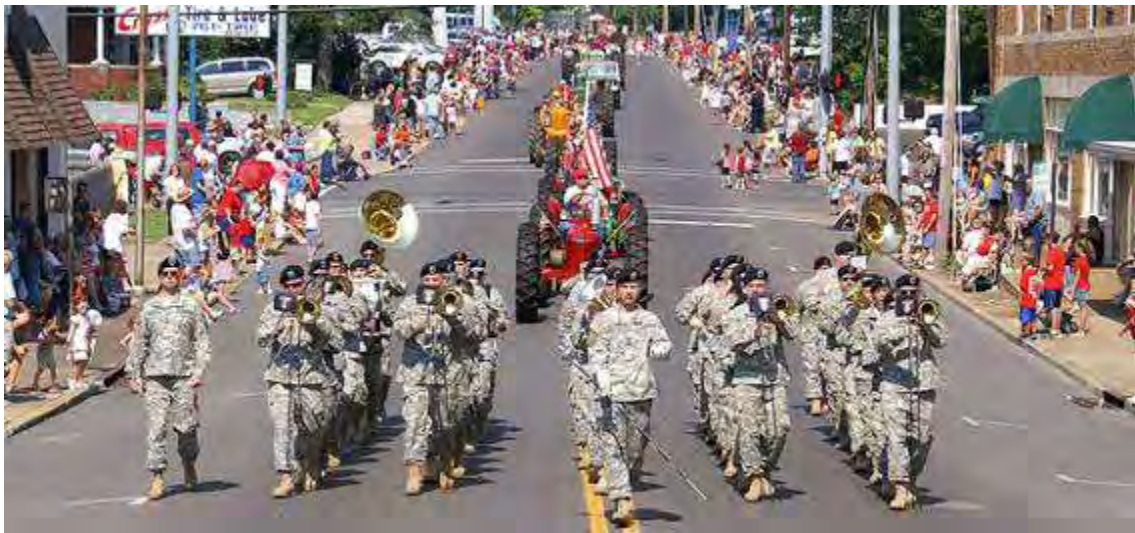
The 202 nd Army Band Marching Band MPT performs at the Freedom Fest in Murray, KY July 2, 2011.

The 202 nd is a constituent element of the 751 st Troop Command, based in Ft. Knox, Kentucky. The band is headquartered at armory #4 at 1700 Louisville Road, Frankfort, Kentucky.