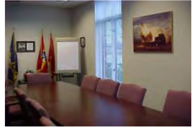
Library/Small Meeting Room