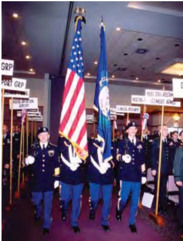
The 138th Field Artillery posts the colors to open the Business Session of the 71st Annual National Guard Association of Kentucky Conference Feb. 16 in Bowling Green.