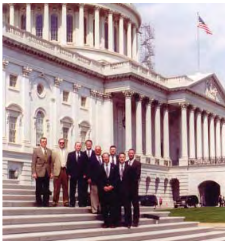
The National Guard Association of Kentucky's legislative committee poses on the Capitol steps in Washington, D.C. following their visit with Congressional staffers April 17.

TAG briefs Congressional staffers on Kentucky status -- Association officers advocate for Guard issues