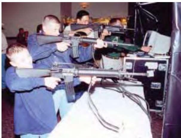
Ready ... Aim ... Fire! The FATS trainer is always one of the most popular exhibits.