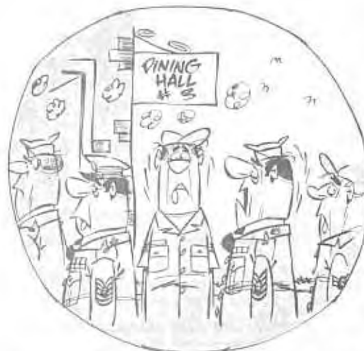
"I wasn't as suspicious about that chow hall meat 'til I found out it's inspected by a volenanian!"