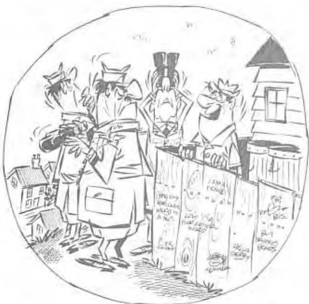
"No, I don't know anything about my neighbors reporting UFO sightings. I'm back here looking for my garbage can lids that blew away in the windstorm this morning!"