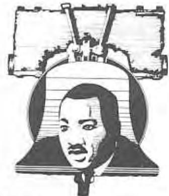
Living the dream: Let freedom ring!

1968 . . . On April 4, 1968, before joining Memphis, Tenn., sanitation workers for a planned protest march, he is assassinated.