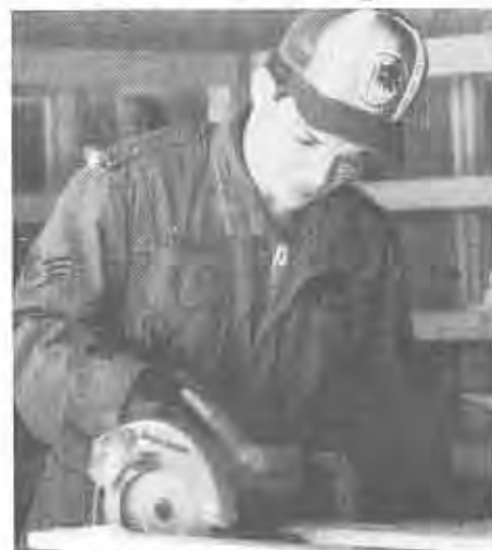
KyANG Photo by SrA Dennis L. Robinson

Now the scout camp will be able to handle 1,200 youth over a week-end and 500 youth and leaders for summer camp.