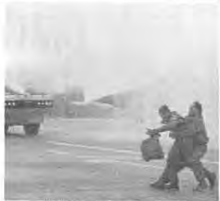
KyANG