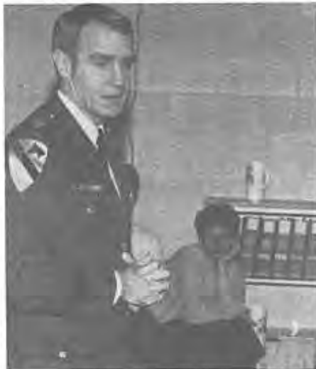
KyANG

The Air Guard is in terrific condition right now. I want to make sure that we identify the areas of support that we can provide and to keep them at a very high readiness level. We have some challenges coming up