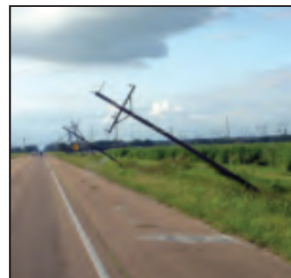
Downed power lines near Baton Rouge, La. made roads dangerous for recovery operations during the first few days following Hurricane Gustav.

681 Soldiers and Airmen working the mission. By the end of the deployment, the Guardsmen distributed 2.9 million bottles of water, 1.3 million MRE's, 288,450 bags of ice and 26,880 tarps.