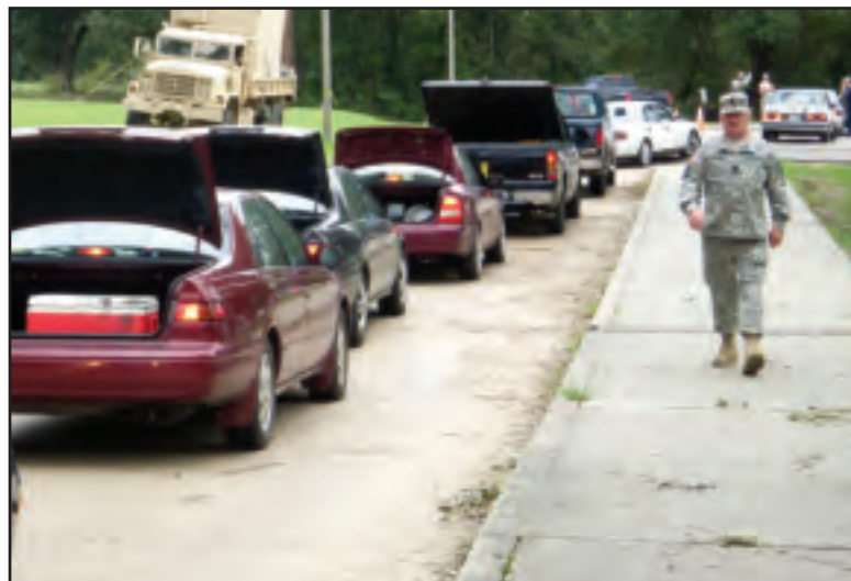
◀ Cars are staged with trunks open and ready to receive bottled water, MRE's and ice which were being handed out by Soldiers from B Co., 103rd Brigade Support Battalion based out of Harrodsburg, Ky.