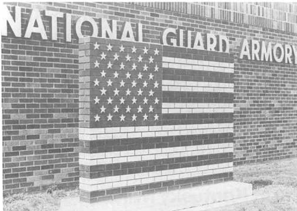
THE CINCINNATI Bricklayers Union recently donated this enamel brick flag to the Walton Armory. Built by the bricklayers as a training project, each brick was individually hand-painted before the flag was assembled and the stars were added. The flag can be viewed from Interstate 75.