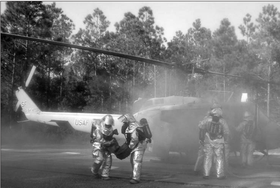
Above: Firefighters from the Kentucky Air Guard's 123rd Civil Engineering Squadron practice extracting wounded aircrew members from a smoking helicopter during Silver Flag 2006, held at Tyndall Air Force Base, Fla., from Oct. 14 to 21.

Airmen representing all four of civil engineering's primary missions — Air Base Operability (also known as disaster preparedness), Fire Protection, Explosive Ordinance Disposal and the Base Emergency