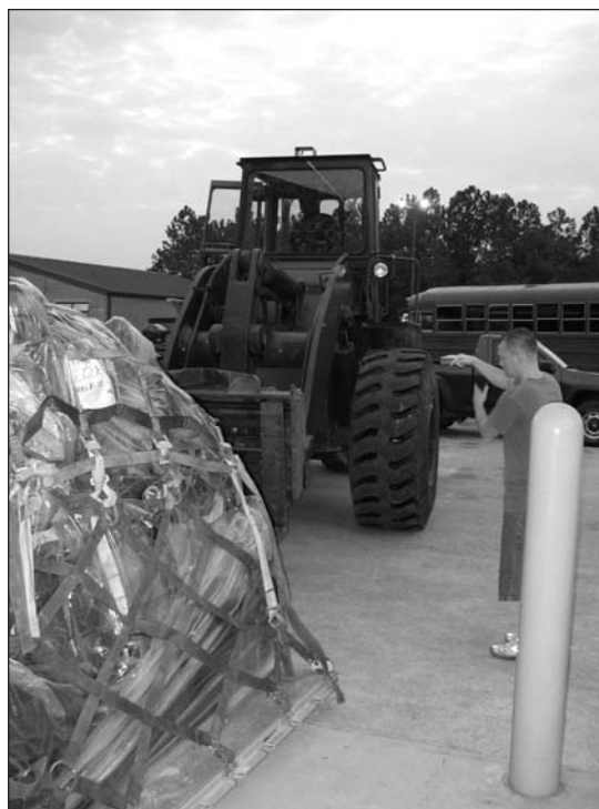
Right: Members of the 123rd Civil Engineering Squadron marshal pallets of equipment and cargo for deployment during Silver Flag 2006. The training event is required for all Guard, reserve and active-duty civil engineering units approximately once every three years. The Kentucky unit last completed Silver Flag training in 2003, just before being deployed to Iraq.