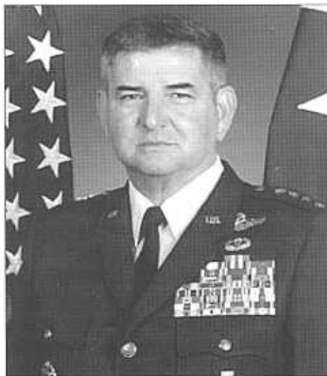
Gen. Ronald R. Fogleman Air Force Chief of Staff

•The first core competency is called Air and Space Superiority , which assures a fundamental benefit to all forces across the full