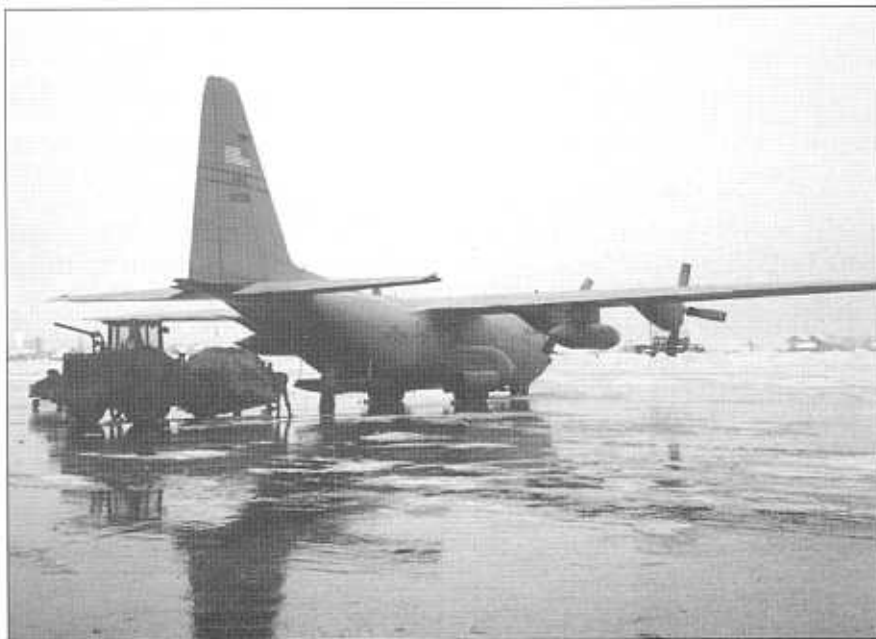
LEFT, ABOVE: French cargo specialists offload pallets and baggage from a Kentucky C-130 at Sarajevo International Airport.