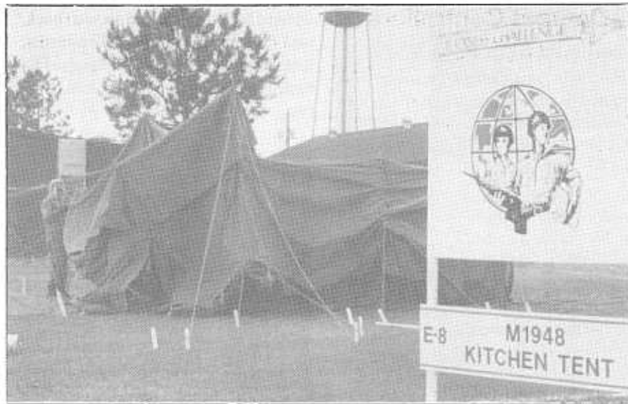
A KyANG team member tightens the ropes on the kitchen tent