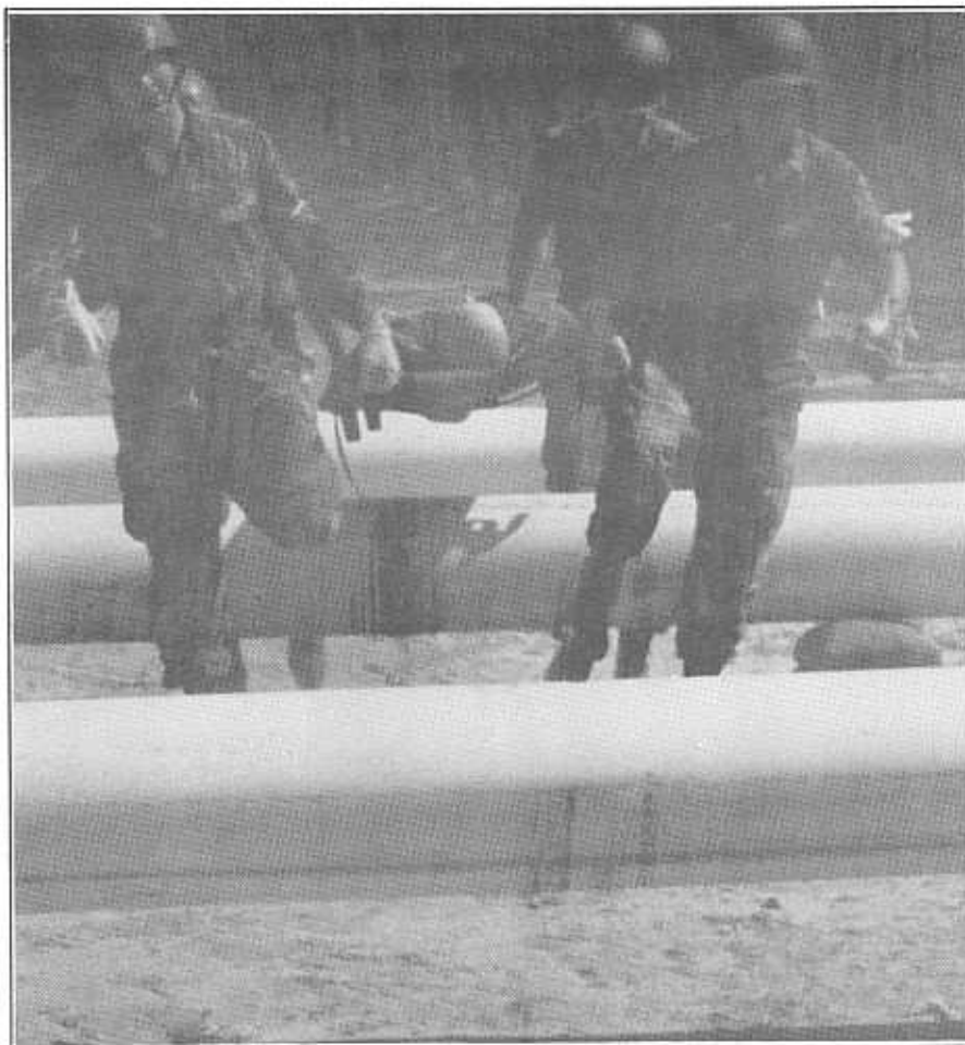
Team members struggle through obstacle course carrying a stretcher