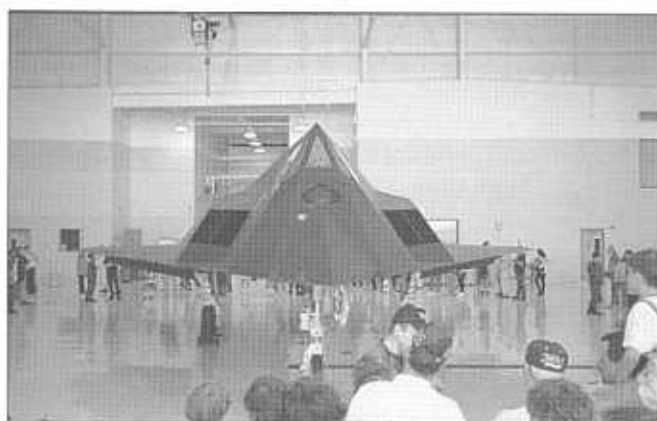
This F-117 Stealth Fighter, displayed behind a rope in the hangar, was a crowd favorite at the air show.