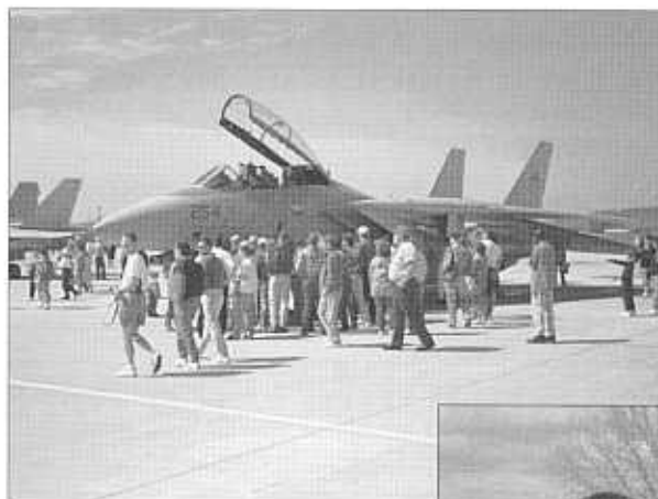
ABOVE: This F-14 Tomcat was one of several Navy aircraft on display.