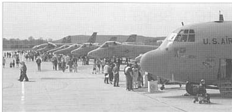
Crowds found a tarmac filled with 16 types of aircraft, ranging from Apaches to a KC-135 Stratotanker.