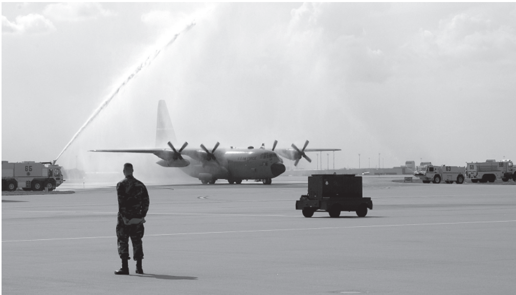
LEFT: Each of the five returning Kentucky Air Guard C-130s were welcomed with a drenching spray from the base fire trucks.