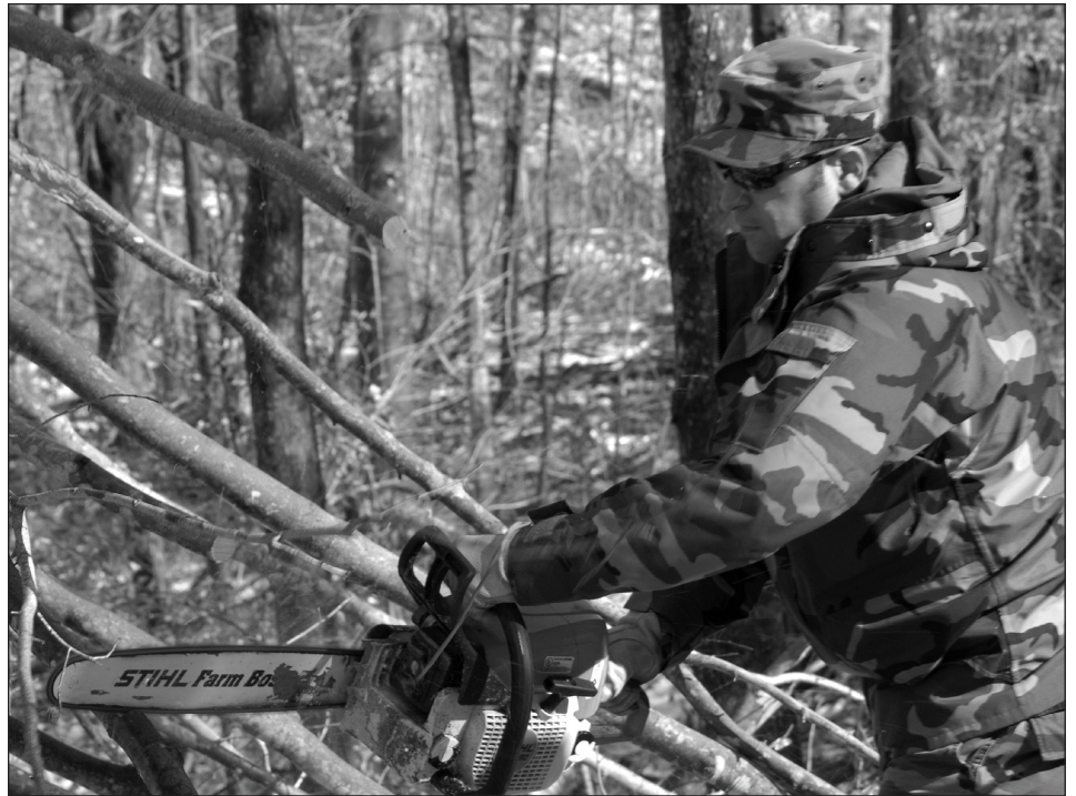
Above: A member of the Kentucky Air Guard's 123rd Civil Engineer Squadron clears debris from a road outside Hardinsburg, Ky., so military vehicles can gain access to remote areas of the community.

The first deployment site was Breckenridge County, where the majority of