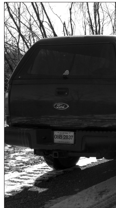
Members of the 123rd Civil Engineer