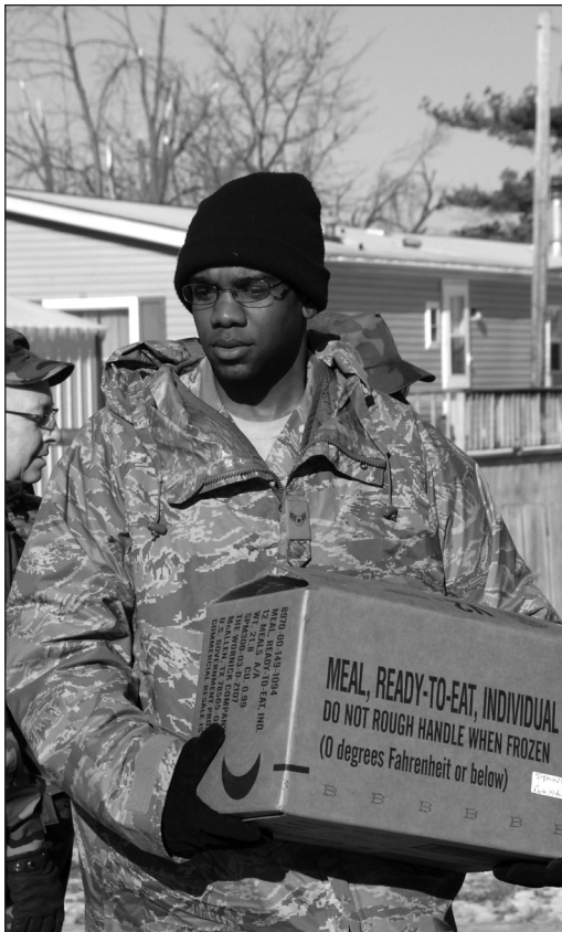
Above: Meals, Ready-to-Eat provided the main sustenance for nearly 145 Kentucky Airmen who were conducting relief operations and wellness checks in rural Breckenridge County on Feb. 1.