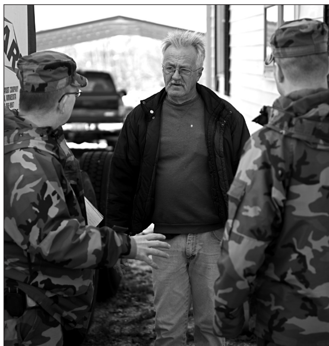
Left: Kentucky Airmen ask a resident if he needs assistance during wellness checks being conducted in Breckenridge County, Ky. Troops went door-to-door until every home in the county was canvassed — a process credited with saving at least two lives.