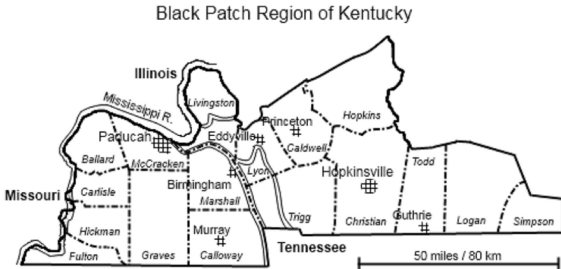
Figure 1: Map of the Black Patch Region (by author)

tobacco products depend on the dark leaf variety for their distinctive flavor. A group that controls the tobacco in this region of western Kentucky and Tennessee controls the worldwide supply of dark leaf tobacco. Dark leaf tobacco was the dominant cash crop and export product of the Black Patch, so the economy of the region depended on the fortunes of the dark leaf tobacco market. 7