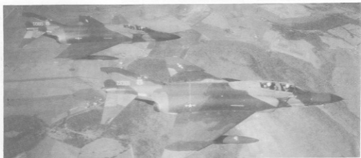
Kentucky Air Guard pilots in their RF-4C Phantoms arrive over Norway after a 3600 mile non-stop journey.