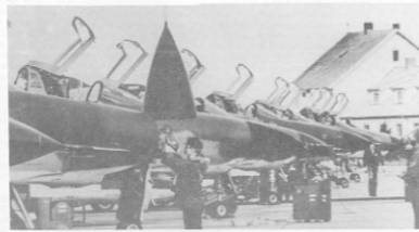
Kentucky Air Guardsmen prepare for assignments during the "CORONET SNIPE" exercise in Sola, Norway. (Story and more photos inside)