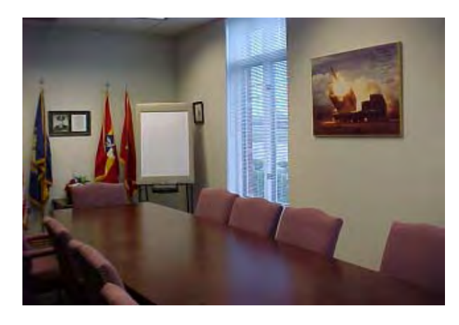
Library/Small Meeting Room