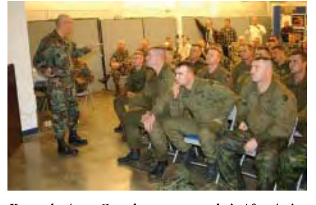
Kentucky Army Guardsmen go over their After Action Review following their 19 Oct. DFIRST demo.

The DFIRST<sup>TM</sup> system includes instrumentation for up to 45 vehicles and was originally designed for the M1A1 tank and M2 Bradley combat vehicles; however, the system has supported up to 150 vehicles covering 30 different vehicle types, including former Soviet