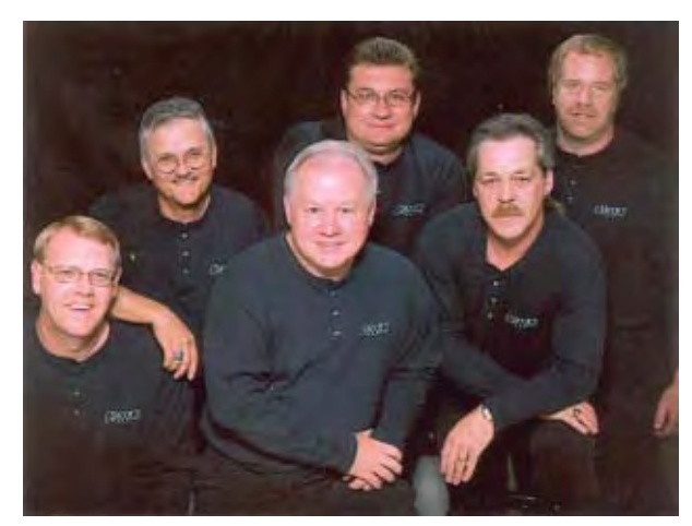
The Classics, featuring the best of Rock and Roll, will perform at the 72nd Annual NGAKy dinner.

The Classics have also appeared with the Eastern Kentucky University Symphony Orchestra for the past three years performing Rock and Motown classics