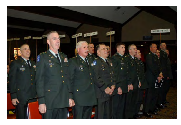
Members of the 138th FA Brigade announce their presence during the roll call of units.