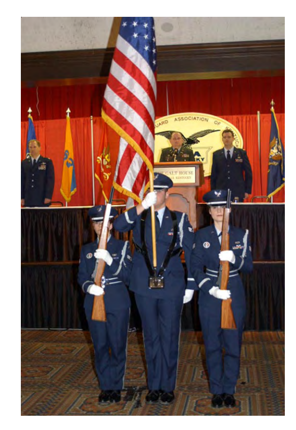
The Kentucky Air National Guard posts the Colors during the opening session of the 72nd Annual Conference of the National Guard Association of Kentucky.