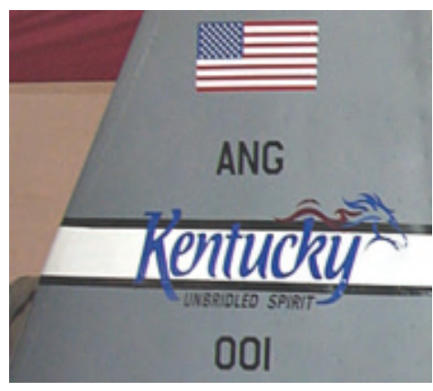
The Unbridled Spirit logo tail flash for the Kentucky Air National Guard's C-130 aircraft.