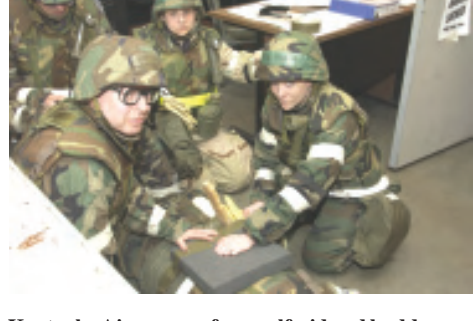
Kentucky Airmen perform self-aid and buddy care on a "wounded" individual during the 123d Airlift Wing's April 2006 Operational Readiness Inspection at the Savannah, Ga. Combat Readiness Center.