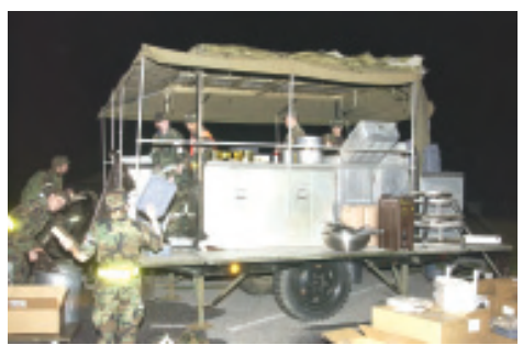
Services personnel set up a mobile field kitchen during the night shift of the 123d Airlift Wing's April 2006 Operational Readiness Inspection at the Savannah, Ga. Combat Readiness Center.