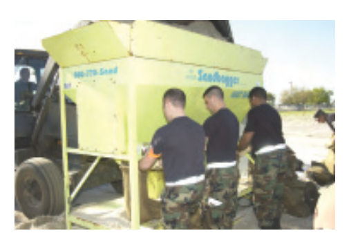
Kentucky Airmen fill sandbags used to harden structures across the base during the 123d Airlift Wing's April 2006 Operational Readiness Inspection at the Savannah, Ga. Combat Readiness Center.