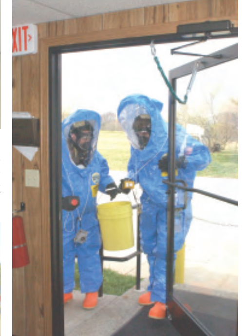
Members of the 41st Civil Support Team in Louisville practice a decontamination exercise at the Joint Mail Operations Building on Boone National Guard Cetner in Frankfort.