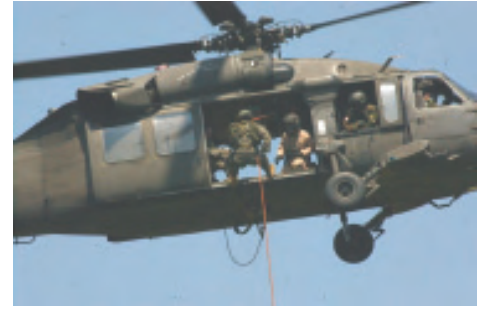
Army Guardsmen with the Joint Support Operations (JSO) counter-drug mission based in London, KY rappel from a UH-60 Blackhawk during the Kentucky National Guard's Family Support Camp at the Wendell H. Ford Regional Training Center in June.