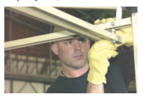
A member of the 123d Airlift Wing's Readiness Squadron assembles equipment for a chemical decontamination station during the Wing's April 2006 Operational Readiness Inspection at the Savannah, Ga. Combat Readiness Center.