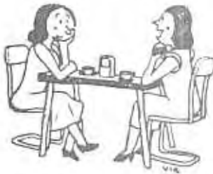
"I think he's a navigator. he's always wanting more latitude!"

The original must be presented to the County Court Clerk of the members county of residence in order to purchase the Kentucky National Guard license plate. One copy will be retained for unit file.