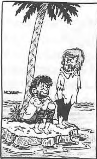
"AND STOP REMINDING ME HOW YOUR SAVINGS BONDS ARE EARNING INTEREST!"