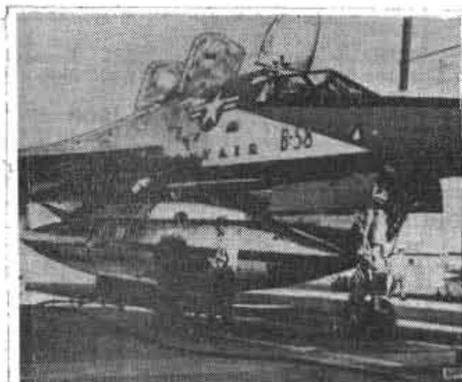
SOMETHING NEW - The maximum range of the Air Force's supersonic B-58 Hustler has been greatly extended with the addition of this new two-component pod. The lower portion of the pod can be jettisoned when it's fuel is exhausted, and the upper part, which carries both fuel and the bomber's payload, would be dropped on target during combat.