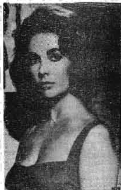
BURNING BRIGHT — Elizabeth Taylor gets another sultry role as Gloria Wandrous, John O'Hara's wayward Manhattan playgirl in "Butterfield 8".