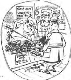
That's not the way we serve messhalls in this mess hall. Airman Sidecocket.