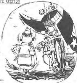
It was that tanker's fault, Sir, he hooked right into me on my starting approach.