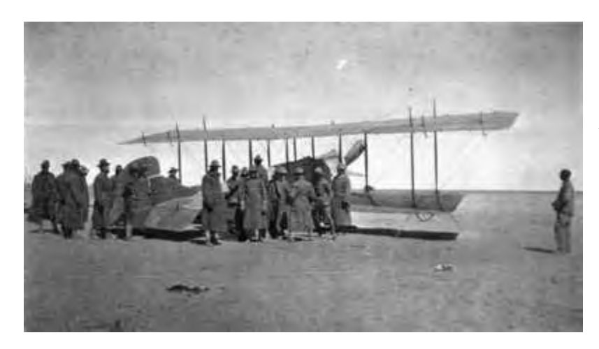
KYNG members gather around a Signal Corps plane taken sometime between August 1916 and February 1917. This is believed to be Signal Corps plane No. 75, A Curtis R2, which was delivered to Columbus in May 1916.

The Kentuckians probably got their first opportunity to see military aircraft in action as the 1st Aero Squadron conducted operations and messenger services in the area. It may have even been the first airplane many of them had ever seen.